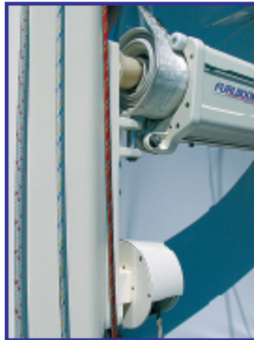
Open front prevents sail jamming