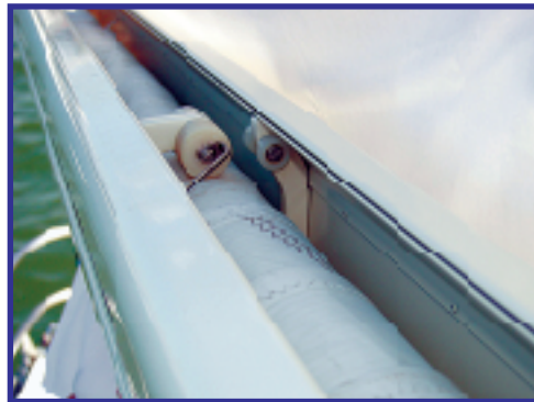
Internal rollers provide efficient sail flattening