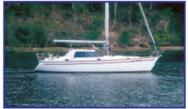
Lightweight, unobtrusive, tapered design.

"Dear Furlboom, The sail and boom are fantastic. We have been in variable conditions in the Bay and off the coast in winds to 30 knots so far and the performance and the ease of sail control for Roz and I has been excellent!"