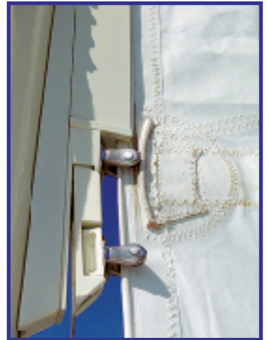
Sail track with one-piece PVC runner and self-guiding feeder